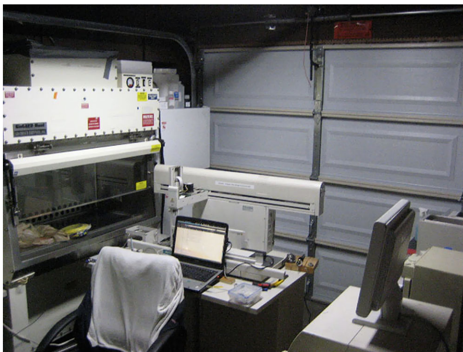
FIG. 3. Private biotech laboratory in a Californian garage. The people who built this laboratory are semi-wealthy Silicon valley engineers who got interested in biotechnology. The project that they are pursuing is technically well beyond anything discussed by the www.DIYBio.org community. The exact location of this garage has not been revealed because of fear of police raids, as garage biologists may still be perceived as potential bioterrorists by the U.S. government.